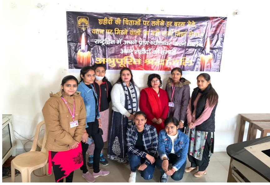
Students and the faculty of History department