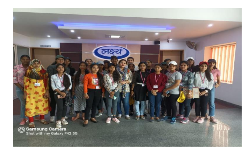
Visit to Lakshya Milk Plant